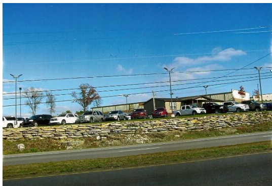
View of site from the North