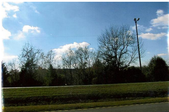
View of site from the South