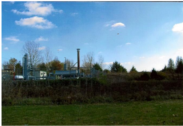
View of site from the East