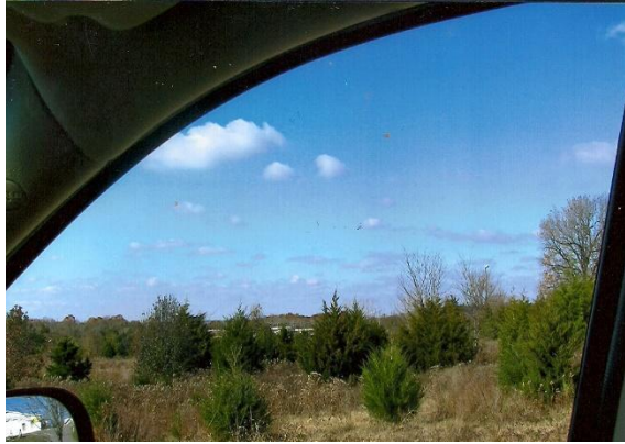
View of site from the West