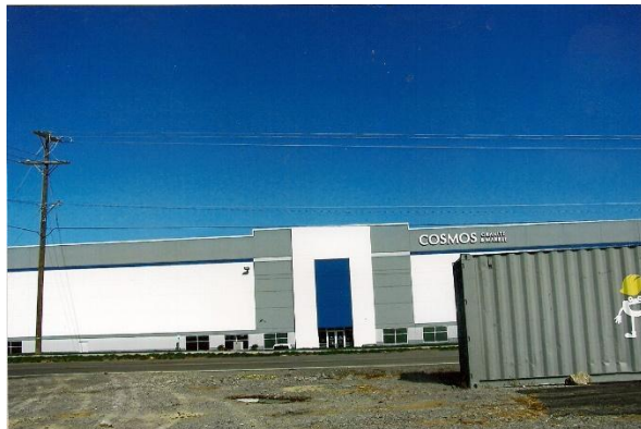
View of site from the North