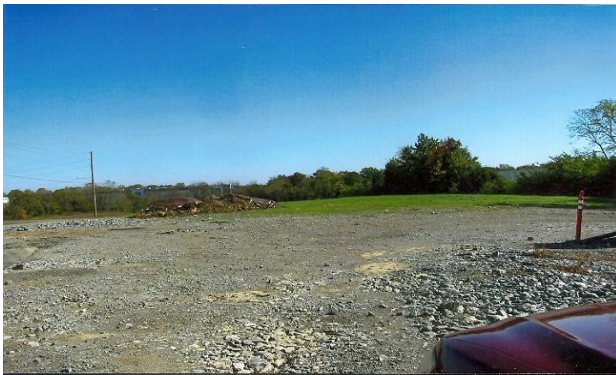
View of site from the West

December 30, 1862 - Skirmish at La Vergne – Note 1