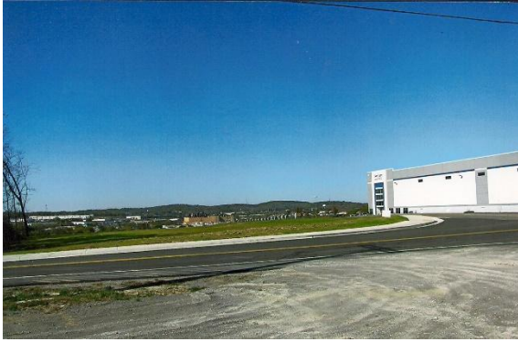
View of site from the East