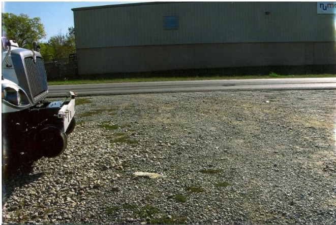
Site looking west