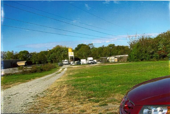
Site looking east