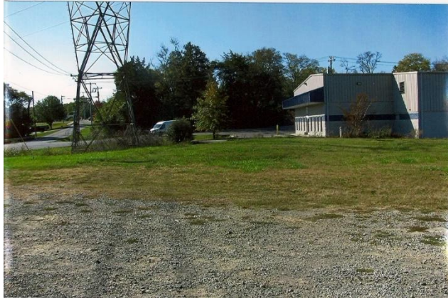
Site looking north