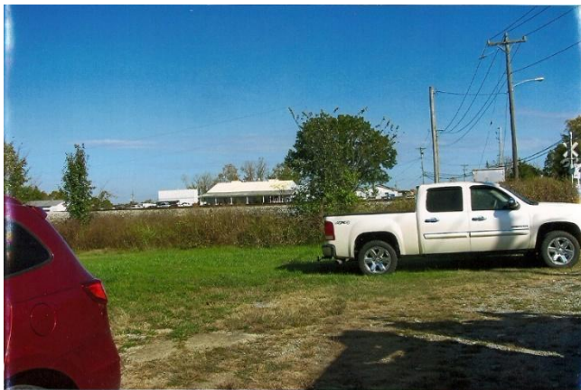
Site looking south